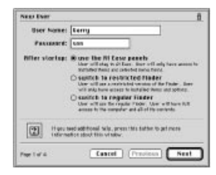
At Ease 3.0 uses a simple set-up application that guides you through the process of creating an At Ease configuration for each user.