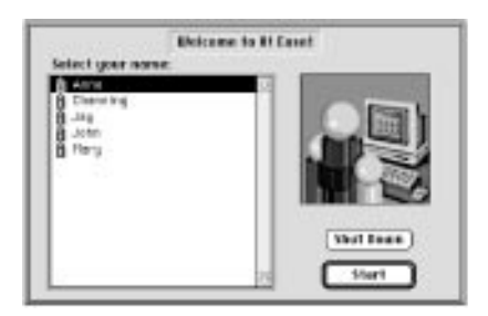
At Ease 3.0 makes it easier to sbare your family Macintosb by giving users access to their own At Ease items and documents.